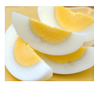
HARD BOILED EGG