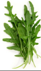
ROCKET (ARUGULA) $6.50 Small $8.50 Large