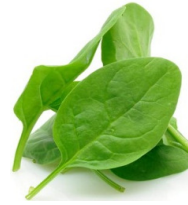
BABY SPINACH $6.50 Small $8.50 Large