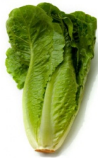
ROMAINE LETTUCE $5.50 Small $7.50 Large